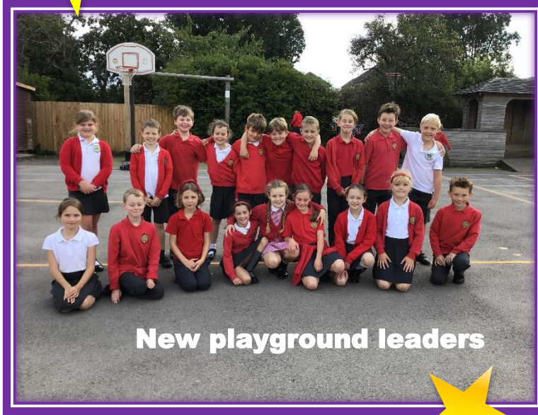
New playground leaders