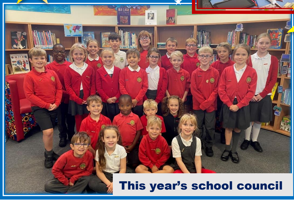
This year's school council