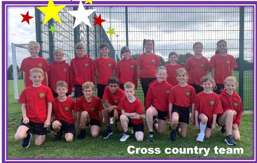
Cross country team