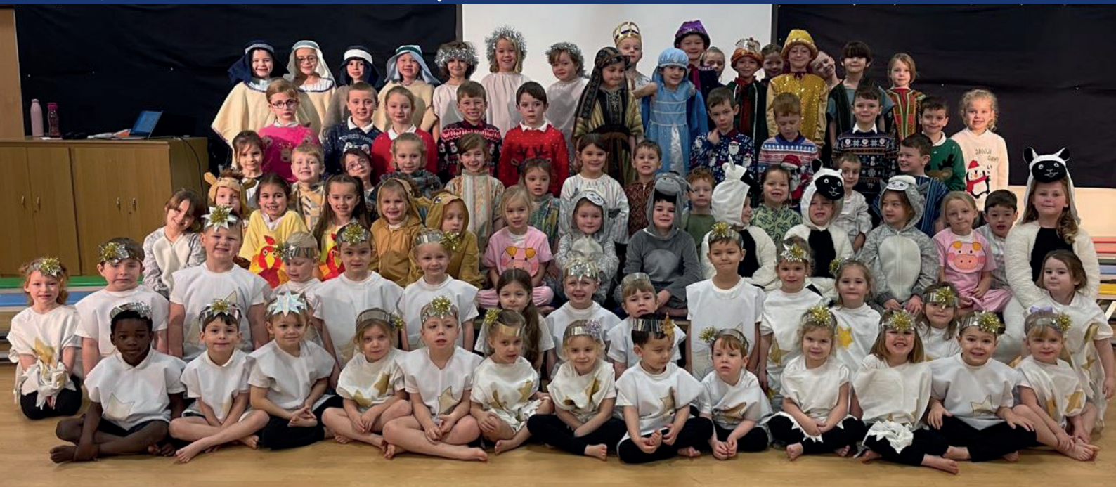
Sparkling stars: The children of Puriton Primary School staged The Bossy King as their nativity production