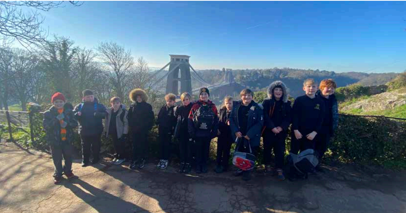
A beautiful day for exploring ... Aspire Academy students visit Bristol as part of their project on bridges