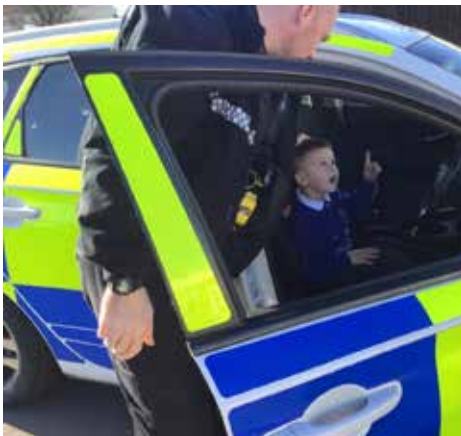
Police visited the EYFS children at Bridge Farm as part of their work related to the local community.