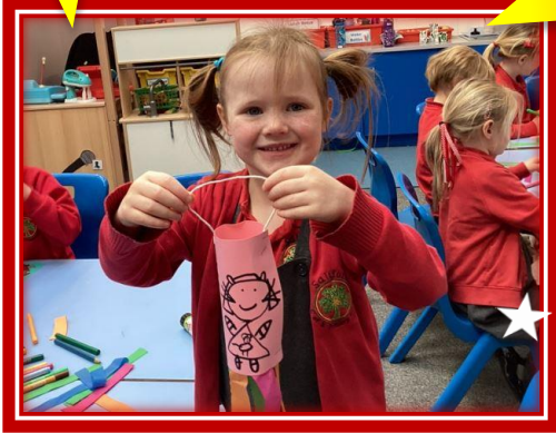
A year 1 child shows off her stylish windsock, which she will use to check the direction of the wind.

Recording shadows in year 1 and measuring the movement of the sun.