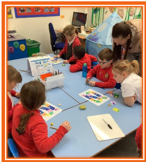
Year 2 children played a game called Can you help me please? They discussed how different scenarios would make them feel and what they could do.

Each class page on the website has a link to the current curriculum overview which shows the detail for each subject. You can also read more about Computing at Saltford here on the curriculum page of the school website.