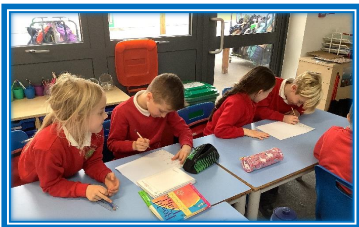
Year 3 children had to create an 'Alpha-Net' and think of something beginning with each letter of the alphabet that they enjoy about being online.