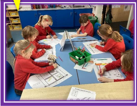
Year 1 children read the story Hanni and the Magic window and were tasked with creating their own magic window.