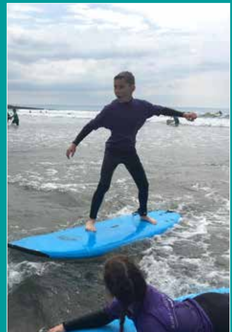
Year 6 went to camp at Simonsbath, where they enjoyed wonderful weather and fantastic activities.